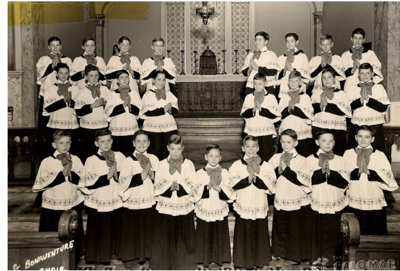
St. Bonaventure Choir 1945-46